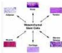
Figure 1. Multilineage differentiation potential of mesenchymal stem cells (MSCs).

Under appropriate conditions, MSCs are able to differentiate into cell types of different lineages, including bone, cartilage, adipose, muscle, tendon, and stroma. The arrows are presented as bidirectional, indicating that differentiated MSCs are capable of dedifferentiation and transdifferentiation. Adapted from [89].